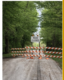
CR 210 is closed at the triangle; the Starke County Highway Department is rebuilding the dangerous triangle intersection.

Adopt-a-Buoy —This program adds buoys to areas of the lake to give our members more shoreline protection. The BLPOA buys the buoys; volunteers put them in and take them out. Contact Gary Laiter (773) 750-4049 if you no longer want your buoy or if you would like to become a "caretaker."