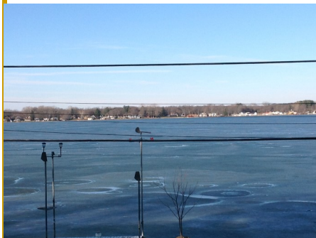
Can you see the crop circles? Remember the movie "Signs"? Or are these circles the result of our lake springs?

leaves out of the lake. Grants to help with the cost of glacial stone installation are available and will be pursued.