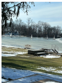
Grace Hehemann, our newsletter photographer, took this photo of the 2023 ice sailing at Bass Lake!

These sailboats are supported on metal runners, steered with a rear blade. They race over ice at speeds of up to 60 mph.