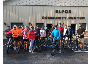
This is the group that participated in the 2022 BLPOA - Prairie Trails Club bike ride.

As mentioned in last month's newsletter, Prairie Trails Club has been chosen by the national Rails-to-Trails Conservancy to host a signature event for Celebrate Trails Day on Earth Day, April 22nd. The event will begin at 9:30 a.m. CDT at the Main Street Trailhead in North Judson. It will include two scavenger hunts on the Erie Trail (one for walkers and one for bicyclists) with small prizes for completion, live music by Return to Normal, food & drinks, and a train ride hosted by Hoosier Valley Railroad Museum! The train ride is scheduled to begin at 11 am, and it is first come, first served so please arrive early. A short children's Color Walk will begin around noon, after the train ride. Please join us to celebrate our transcontinental trail!