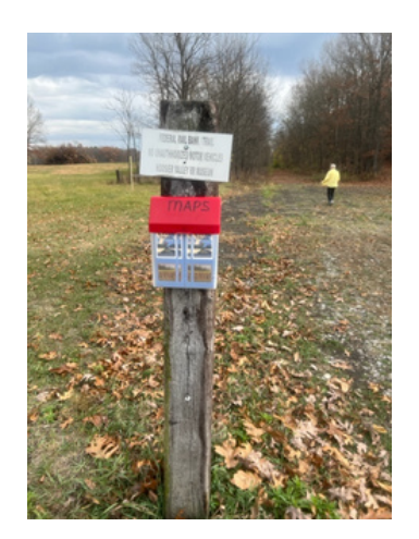
Prairie Trails Club volunteers recently installed a map box on the new trail extension so we can access current trail maps!