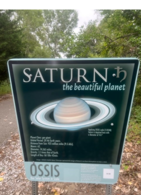
The planet signs along the Erie Trail have been re-installed and repaired!

Property Owners Association: Saturday, October 15 at 9:00 a.m., BLPOA Building