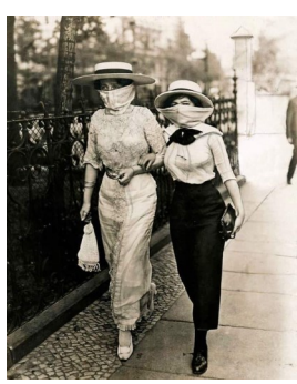
Face masks also came in handy during the Spanish Influenza of 1918!

BLPOA stuff: Plans are to have the May 16th Membership Drive and Sheriff's Golf Cart Inspections as scheduled. Going forward, the BLPOA intends to return to business as usual as soon as possible. In the short run it will be, social distancing, staying home of you feel ill and wearing masks in crowds. Other than that, we are hoping for "normal". May 4 marked Indiana reopening Stage 2. Stage 4 will come on June 13th with bars reopening. The $75 K at the VFW should be back in play. Those with any symptoms will hopefully have the good sense to stay out of public places.