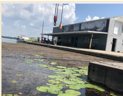
The channel by the marina was full of weeds after the July 4 weekend!

Lake Stocking —Per the DNR website, our lake has been stocked as follows: 2015 - 1,345,140 walleye, 2016 - 116,983 walleye, 2017 - no stocking, 2018 - 229,110 bluegill, 2019 - no stocking.