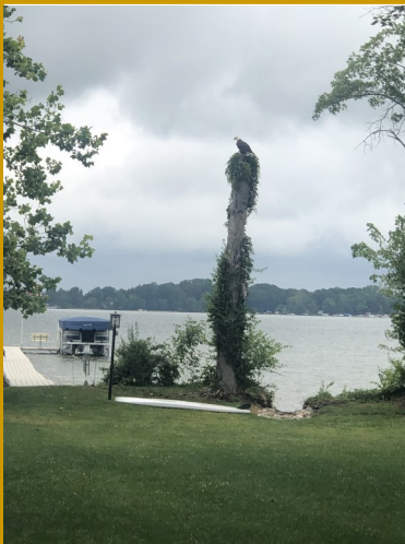
The bald eagle is back at Bass Lake! This picture was taken just last week.

Buoy Questions? Is your buoy broken? Do you want to adopt (or give back) your buoy? Contact our Buoymaster Gary Laiter at (773) 750-4049. If you find a rock in the lake that you'd like to mark with a buoy, you can become a rock buoy foster parent!